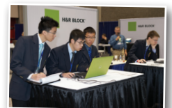
SOCIAL MEDIA + ONLINE CHALLENGES