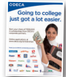
COLLEGE + BUSINESS PARTNERSHIPS