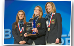
COMPETITIVE EVENTS PROGRAM